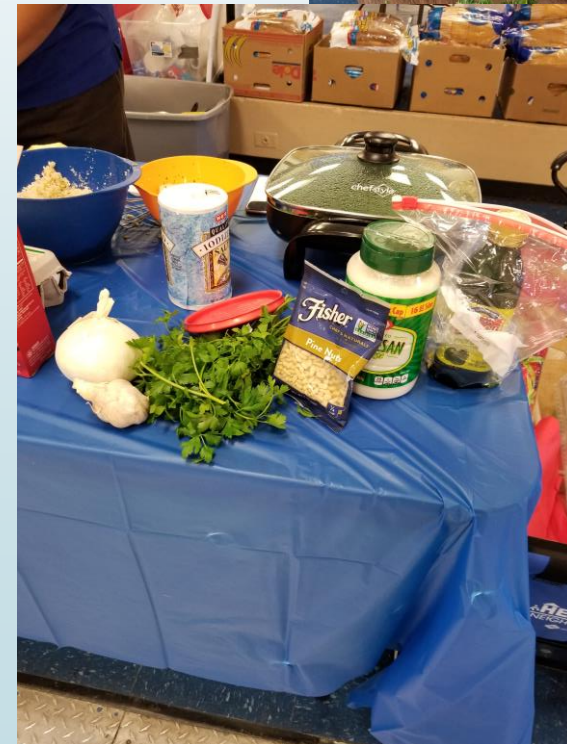
Joaquin demonstrating at Food Pantry.